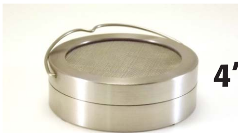
4" Large Capacity Holder (Material: SS316) - Cat# 8771D Interior 0.7" Ht x 4.0" I.D. (17.8 mm Ht x 101.6 mm I.D.) Exterior 1.05" Ht x 4.4" O.D. (26.7 mm Ht x 111.8 mm O.D.) Mesh Material: SS 316 / Mesh Size: 35x35 / Opening: 0.017" (0.43mm)