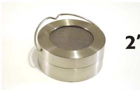
2" Large Capacity Holder (Material: SS316) - Cat# 8771B Interior 0.7" Ht x 2.0" I.D. (17.8 mm Ht x 50.8 mm I.D.) Exterior 1.05" Ht x 2.25" O.D. (26.7 mm Ht x 57.2 mm O.D.) Mesh Material: SS 316 / Mesh Size: 35x35 / Opening: 0.017" (0.43mm)