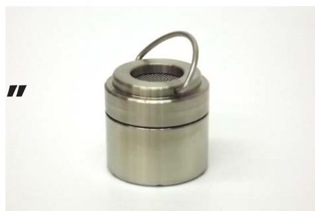
1" Large Capacity Holder (Material: SS316) - Cat# 8771A Interior 0.7" Ht x 1.0" I.D. (17.8 mm Ht x 25.4 mm I.D.) Exterior 1.05" Ht x 1.20" O.D. (26.7 mm Ht x 30.5 mm O.D.) Mesh Material: SS 316 / Mesh Size: 35x35 / Opening: 0.017" (0.43mm)