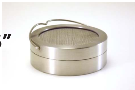
3" Large Capacity Holder (Material: SS316) - Cat# 8771C Interior 0.7" Ht x 3.0" I.D. (17.8 mm Ht x 76.2 mm I.D.) Exterior 1.05" Ht x 3.25" O.D. (26.7 mm Ht x 82.6 mm O.D.) Mesh Material: SS 316 / Mesh Size: 35x35 / Opening: 0.017" (0.43mm)